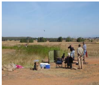
Pete and Ice