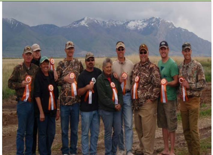
TVHRC Crew at Weber Hunt Test