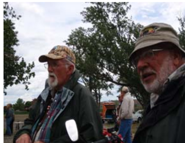
Double Jack's "Ellis & Smith"